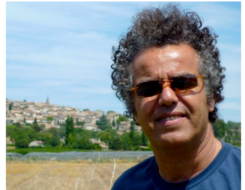
Filmmaker Hakim Belabbes in Morocco.